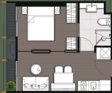
1-BED S (29.81 sq.m.)