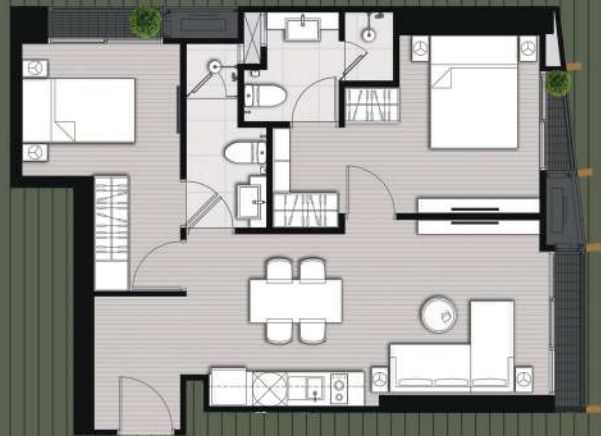
2-BED (58.45 sq.m.)