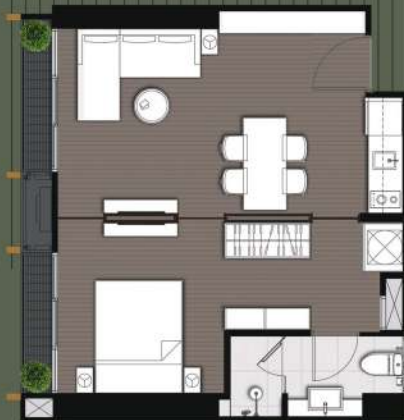
1-BED L (42.55 sq.m.)