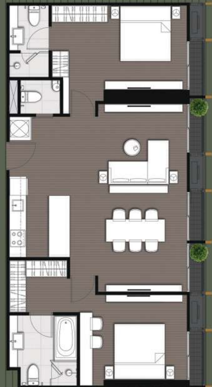
PENTHOUSE (72.68 - 105.97 sq.m.)